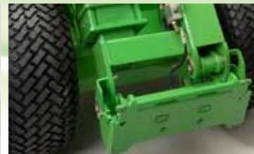
Hydraulic attachment coupling plate