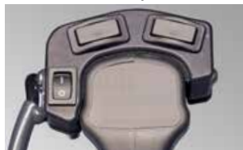
Attachment control switch pack