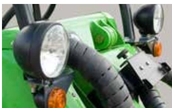
Road traffic light kit