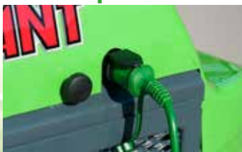
Engine block heater