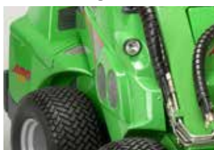
Heavy duty covers