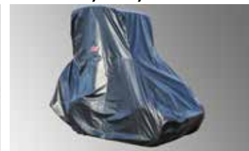
Full weather cover