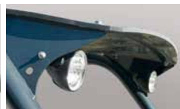
Work light kit