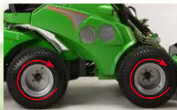
Anti slip valve