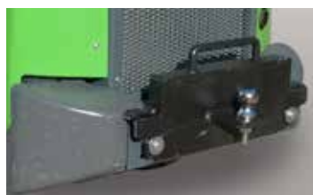
Extra weights, trailer coupling