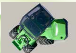
Drive release valve