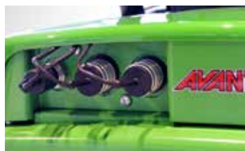
Rear auxiliary hydraulics