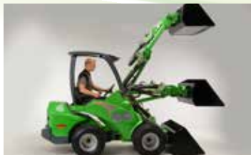
Self levelling boom