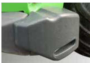
Rear side weights, 400 lb (528)