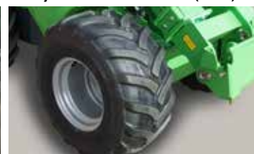
Heavy duty wheels