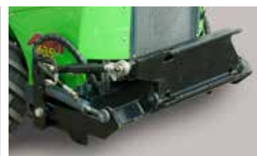
Hydraulic rear lift (528)